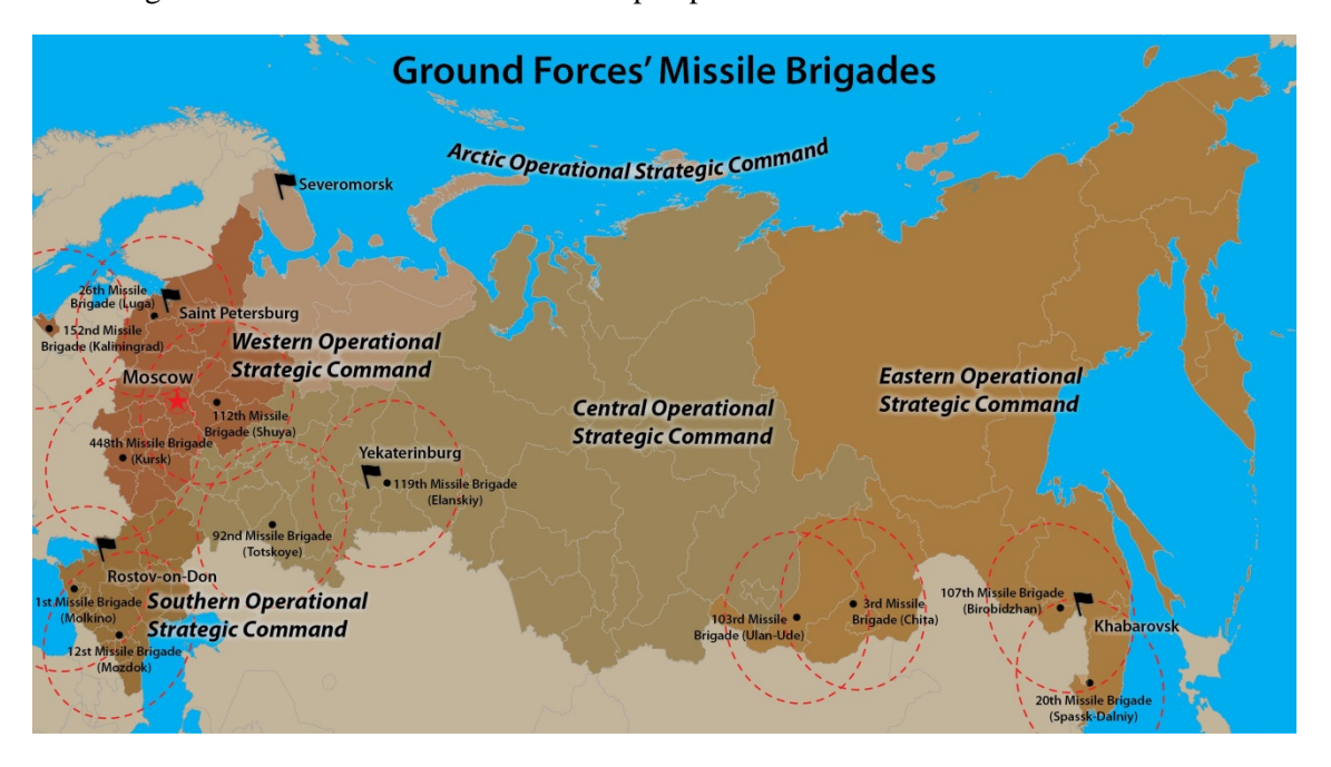
Figure 1.2 Ground Forces' Missile Brigades.

<sup>43</sup> Vladimir Gundarov, 'Innovatsii v raketnykh voyskakh i artillerii,' <a href="http://nvo.ng.ru/nvoevents/2016-11-25/2">http://nvo.ng.ru/nvoevents/2016-11-25/2</a> art.html, Nezavisimoye Voyennoye Obozreniye, 25 November, 2016.