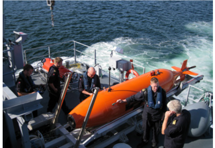
▲ FFI and Norwegian industry have developed HUGIN, one of the world's most advanced autonomous underwater vehicles.

for a small country like Norway, where the communication lines are short and effective. Norway has little opportunity to duplicate expertise. The collaboration model can help the nation utilise its combined expertise optimally. This requires that the different roles are clarified, that cost-effectiveness is the guiding requirement, and that the ethical guidelines are followed.