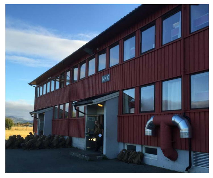
Figure 2.4 MK C, The Battalions' barracks at Ørland air station.

The camp is sited near Brekstad, a small town with about 2000 inhabitants. All conscript soldiers live in the barracks inside the camp, while most of the officers live outside, either at Brekstad or in Trondheim. Many staff members commute between Ørlandet and Trondheim by boat and bus every day.