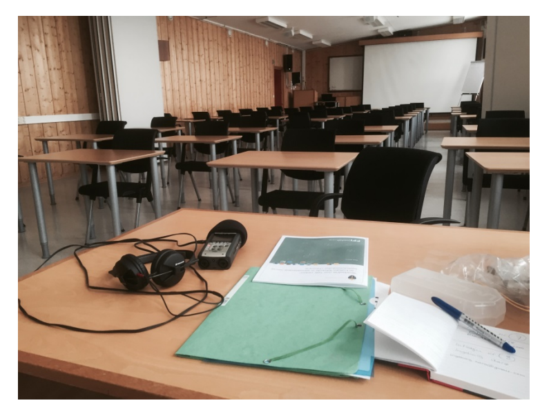
Figure 2.2 Ready for new interviews.

As for the scope of the fieldwork, one could arguably claim that they were too limited to draw any conclusions from the findings. However, as Fangen points out, there are some advantages to this particular use of the method: