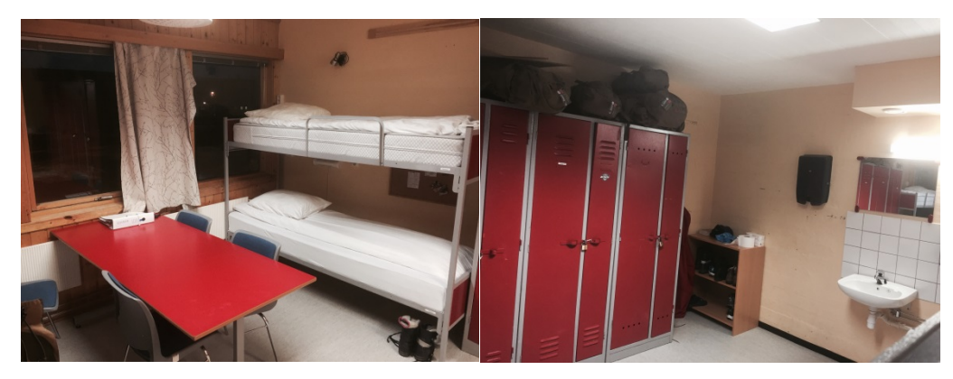
Figure 2.5 Details from a regular room for six soldiers.

Meals are taken in a mess for the enlisted soldiers and an officers' mess. The conscripts seemed to be generally content and positive about the food. The reason for mentioning this in this context is that diet and the social aspect of meals seemed to matter quite considerably in relation to the welfare and motivation of the soldiers.<sup>8</sup> This might, as a consequence, affect their performance.