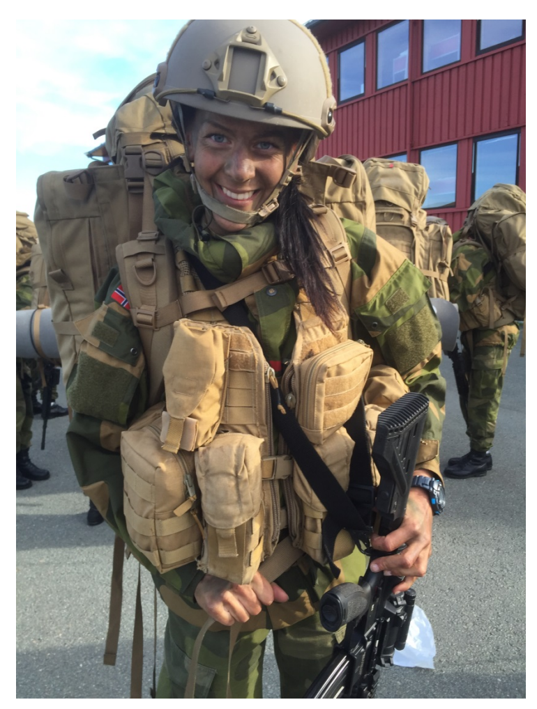
Figure 4.4 Female soldier ready for exercise.

In several earlier studies, we have described the existence of many myths surrounding women in the military (Hellum 2010, 2014; Rones and Hellum 2013; Rones 2015a). When we started the project "Age Cohort Research" in 2008, we were met with the perception that women created "a lot of drama". This perception still lives on in the organisation to some degree. It can seem like it has more to do with how women are treated and considered rather than how they actually behave: