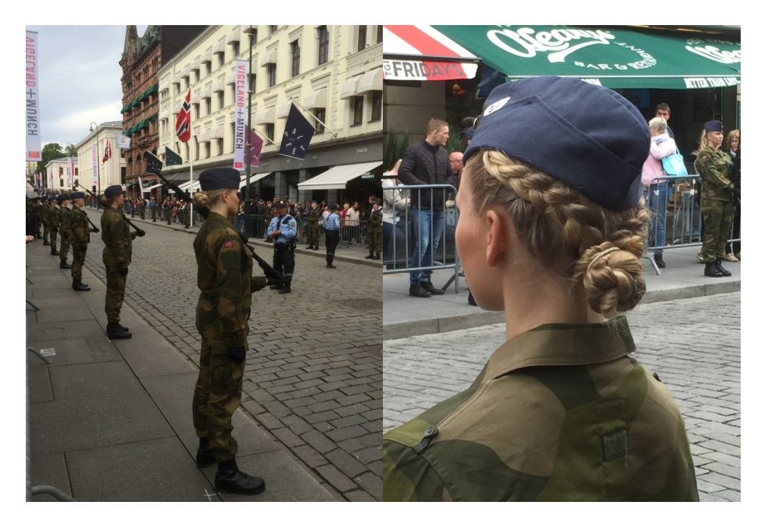
Figure 2.3 The researcher followed the recruits on parade in the main street of Oslo for the King and Queen during the opening of the Norwegian Parliament.