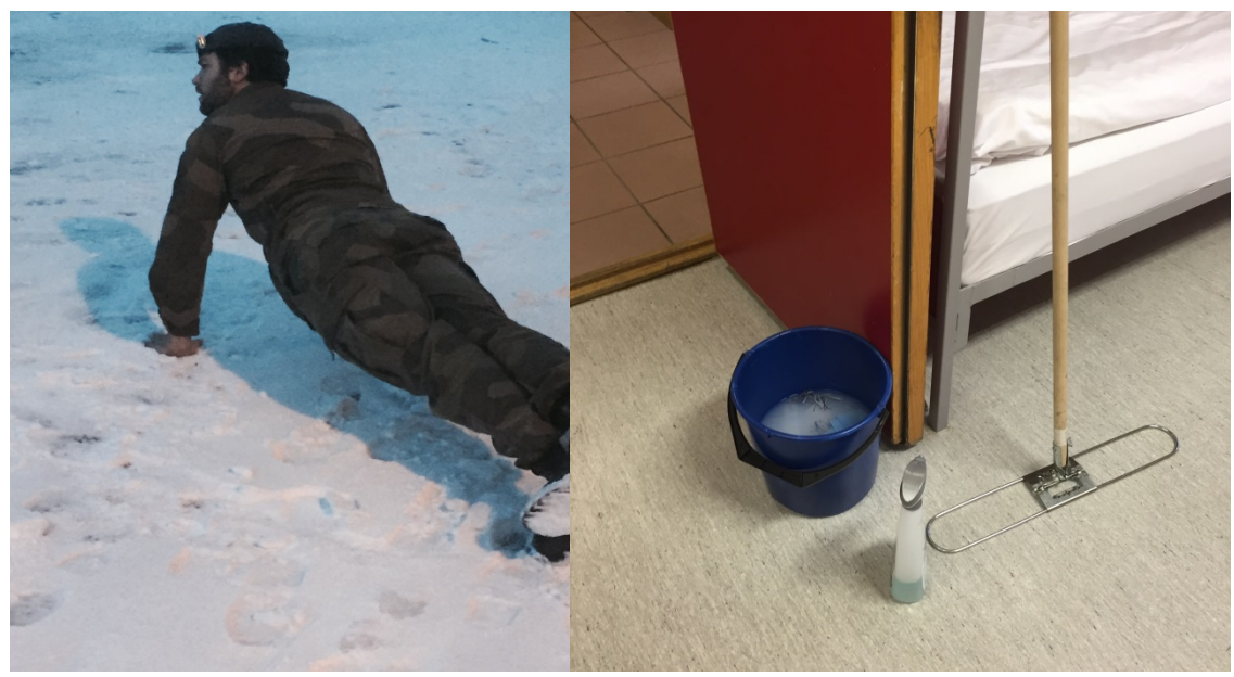
Figure 2.1 Sometimes the researcher is more tempted to observe than to participate.

new and comparative light. To be able to identify different mechanisms, it is crucial that someone who can be presumed to be less biased can observe and interpret with new eyes, eyes which are particularly educated for such a task. The fieldworker may not be able to participate in every activity the informants perform, but must strive to partake in as many as possible in order to get a more thorough understanding of what the informants' lives entail. The ambition is to participate, as well as observe.