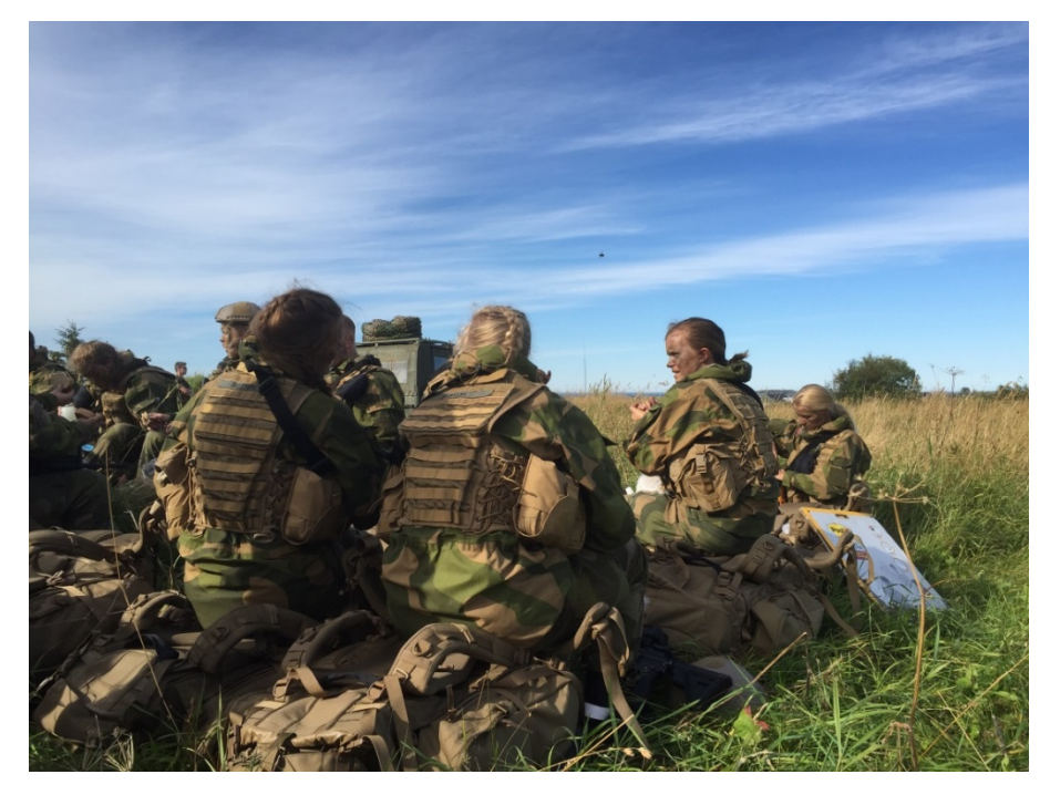
Figure 4.3 The women in the Air and Missile Defence Battalion are mainly "righteous women".

To sum up, the mechanisms at play relating to gender balance and imbalance seem to vary. It is hard to say precisely what works best, since there are different factors affecting the outcome in different units and situations. Nevertheless, we see a tendency towards an even gender balance generally being expedient in reducing prejudice and sexual harassment, while also building a solid foundation for collaboration during service.