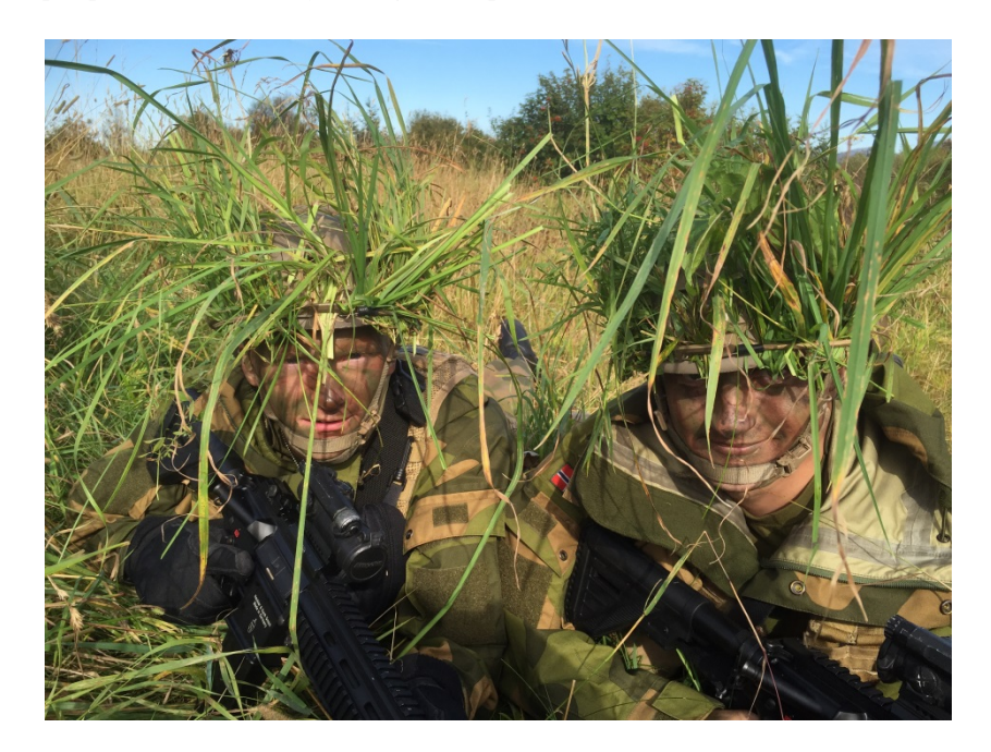
Figure 4.1 Sometimes gender is less visible and relevant.

It's very mixed, I'd say. There are some cautious people as well. Some of that type, you know. As I've understood it, the military wants more serious people now. Not just people who can carry a large backpack, but ones that can do other tasks as well.