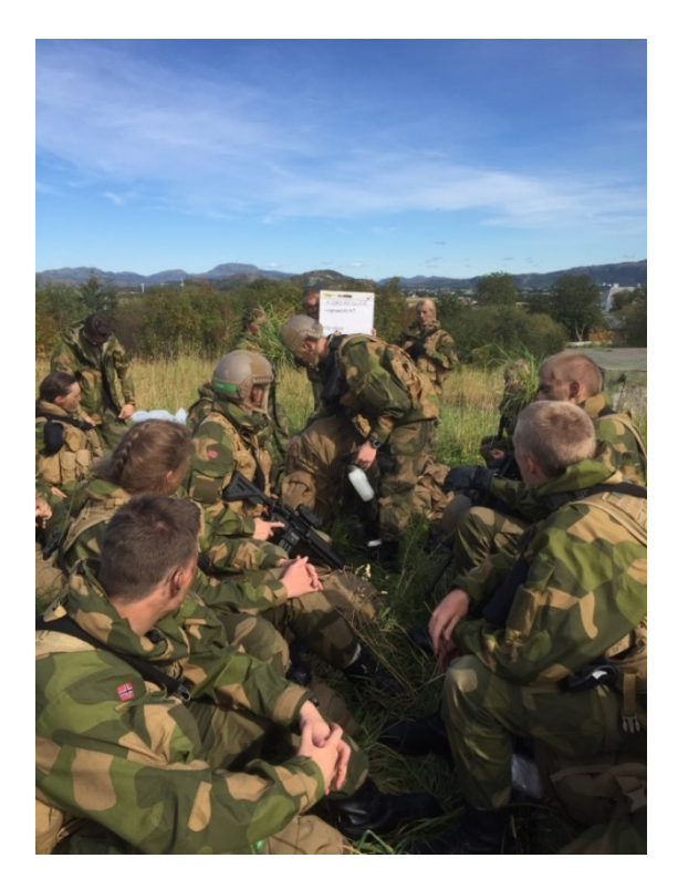
Figure 4.7 The soldiers can easily have discussions regardless of sex, but are often out of synchronisation when it comes to bedtimes.

The scientists present some possible explanations for the observed difference, but no conclusive cause has yet been proved. This is an area which would benefit from further research.