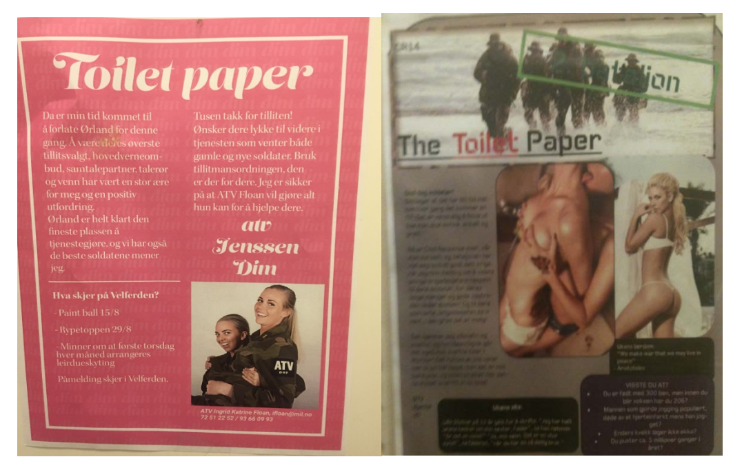
Figure 4.2 Contrast between a Toilet paper in a unit with a high percentage of women (left), and in a unit with a low percentage of women (right).

army battalion with few female soldiers, show a stark contrast between seemingly different cultures. The Toilet Papers are produced by local representatives elected by the soldiers.<sup>11</sup>