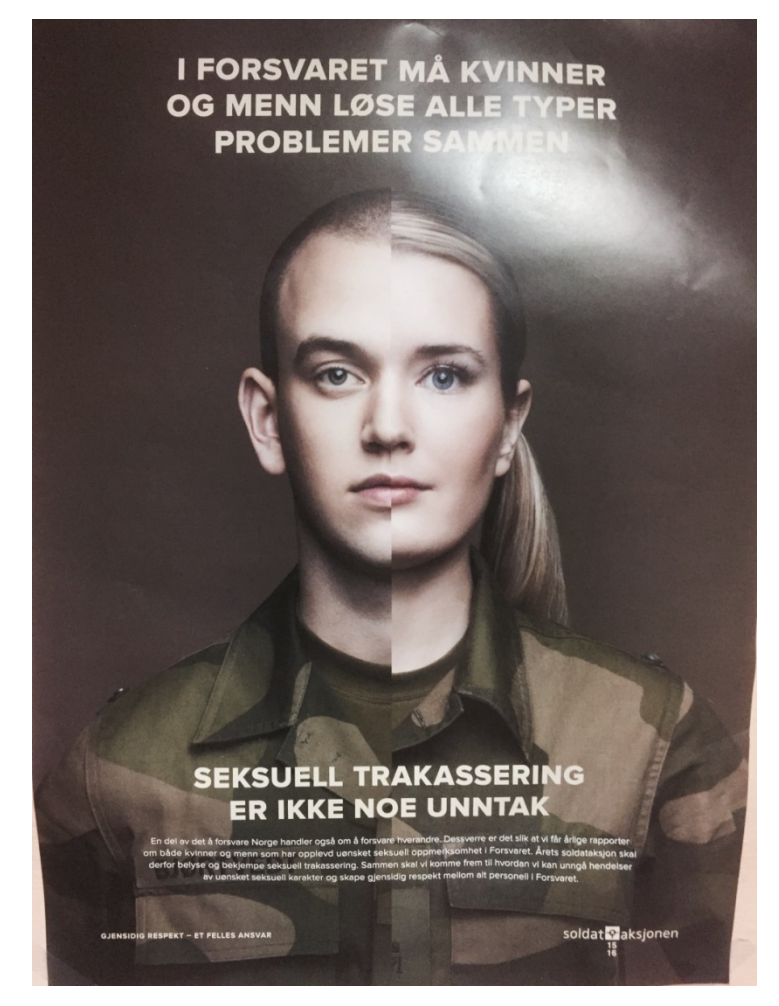
Figure 4.5 From the soldier union's campaign in 2016: "Mutual respect – a common responsibility".

In the Air and Missile Defence Battalion, a poster intended to prevent sexual harassment was hanging just inside the entrance of the barracks. The soldiers in this study seemed to be frequently reminded of sexual harassment as neither legal nor accepted. The theme was brought up several times by commanding officers; conscious use of words and terms was discussed and gone through, there were no signs of acceptance of, nor culture for, treating others disrespectfully based on sex or gender. In the few cases where informants reported sexual harassment, it involved unwanted comments presented in a "humorous" manner.