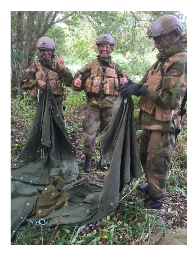
Figure 4.6 Good vibes while buttoning the tent together.

This next male soldier describes the importance of "fitting in". A fellow soldier not "fitting in" is not necessarily bullied or treated badly by the others, but he or she will not be joining the "inner circle" either. The common attitude among the soldiers is that "if you don't fit in, you shouldn't be here":